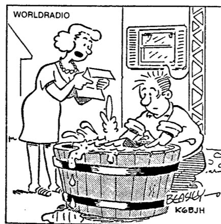
THAT PACKAGE ISN'T FROM YOUR UNCLE "BERTRAM THE BOMBER," IT'S FROM YOUR RICH UNCLE JACK-- HE SAYS "HOPE YOU ENJOY THE NEW YAESU FT1000"

For general information, the first transmission is always something like: N4ABC DE KC6XYZ TNX FOR CALL BT UR RST 599 599 BT NAME HR IS BILL BILL BT QTH KNOXVILLE, TN ? KNOXVILLE, TN BT SO HW COPY? N4ABC DE KC6XYZ KN. And, then the other ham will send the same information is the same sequence. 12 he needs to copy is 599, BILL and KNOXVILLE, TN and he knows everything you sent ... and the same goes for you. Try it, you'll like it! You might even get to like CW!